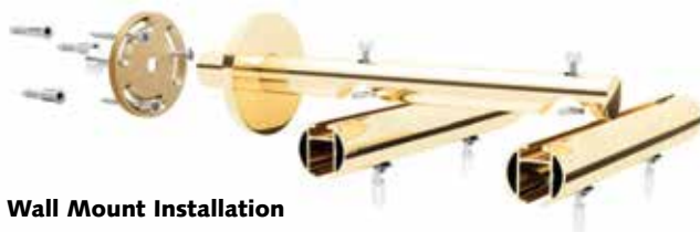
Wall Mount Installation

Attach finials to both ends of the rail.