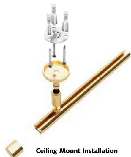
Ceiling Mount Installation