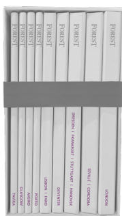
FINISH CHIPS CLUTCH CASE 7 1/2" wide x 4 1/2" deep x 13 1/2" high $250/set