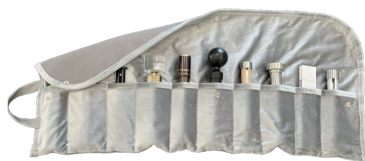
SAMPLES ROLL BAG Open: 34" wide x 16" high Closed: 10" wide x 6" high $250/set