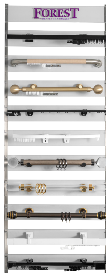
SAMPLE BOARD SET 25 1/4" wide x 53 1/8" high $250/set