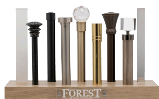
TABLE TOP DISPLAY 19 1/2" wide x 8" deep x 12" high $250/set